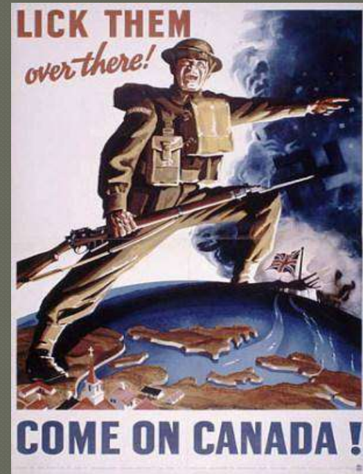
Lick Them Over There - Canadian World War II Poster