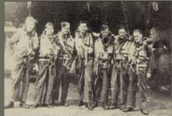
Davies and crew

http://www.military-aircraft.org.uk/ww2-fighter-planes/messerschmitt-me-109-buchon.htm