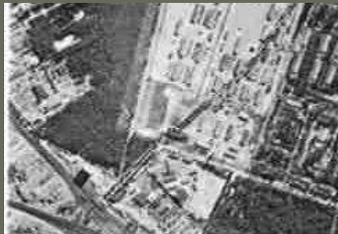
Stalag Luft III