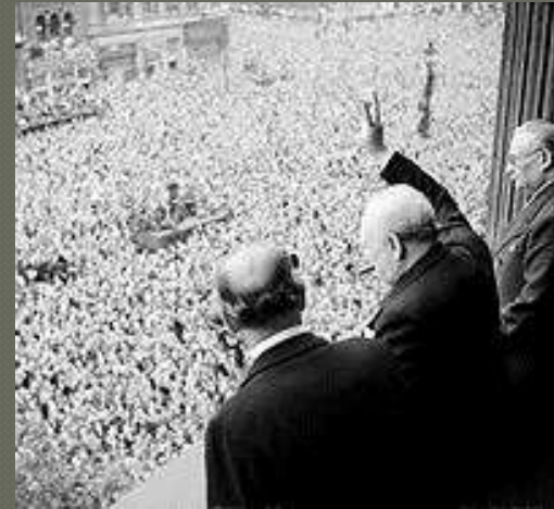
Winston Churchill waving to crowd