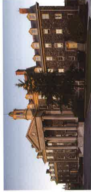
University of King's College campus.

For more information or to apply online, visit hyp.ukings.ca